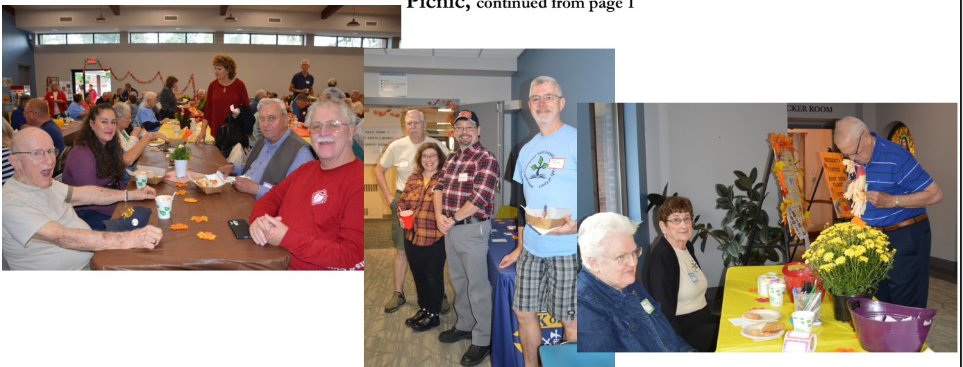
Picnic, continued from page 1

“For I was hungry and you gave me something to eat...” Matt 25:35