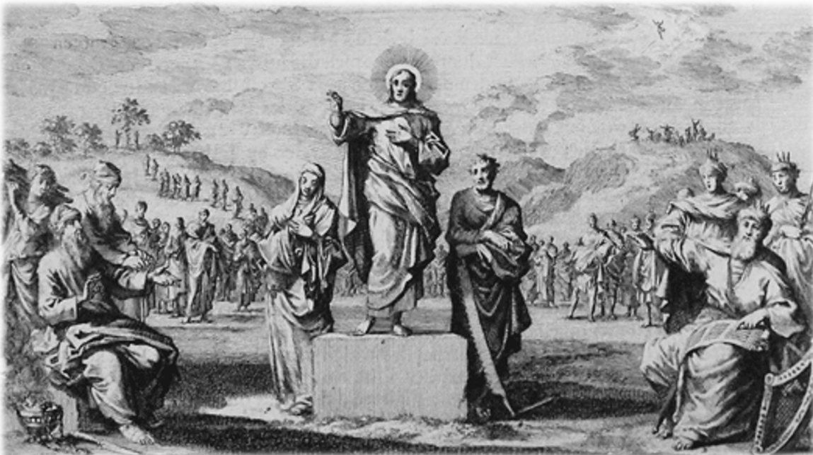
An etching by Jan Luyken representing "Jesus the Teacher" in the Bowyer Bible, Bolton, England, ca. 1840

Then they came to Capernaum, and on the sabbath Jesus entered the synagogue and taught. The people were astonished at his teaching, for he taught them as one having authority and not as the scribes. In their synagogue was a man with an unclean spirit; he cried out, "What have you to do with us, Jesus of Nazareth? Have you come to destroy us? I know who you are—the Holy One of God!" Jesus rebuked him and said, "Quiet! Come out of him!" The unclean spirit convulsed him and with a loud cry came out of him. All were amazed and asked one another, "What is this? A new teaching with authority. He commands even the unclean spirits and they obey him." His fame spread everywhere throughout the whole region of Galilee